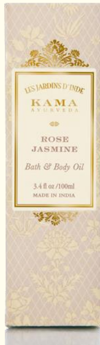
rose jasmine bath & body oil 100 ml