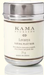
lavanya natural plant mask 25 g