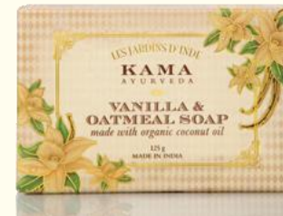
vanilla & oatmeal soap 125 g

Unfailing exfoliation & softness with mridul. Luscious hydration & radiance with Eladi Hydrating Ayurvedic Face Cream. Old-fashioned comfort & simplicity of premium Vanilla, in the Vanilla & Oatmeal Handmade Soap, and Vanilla Lip Balm.