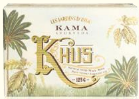
khus natural soap 125 g