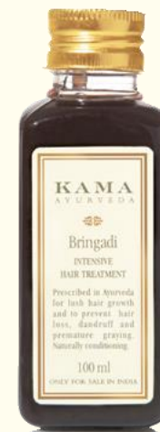
bringadi oil 100 ml

Bringadi Intensive Hair Treatment Oil, for strong, voluminous, shining hair. Sugandhadi Rejuvenating Body Treatment Oil, for a pain-free Body & energised ftind. ftridul Soap Free Cleanse & Navaa Retexturing Soap, for soft, supple, plumped-up skin.