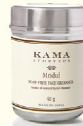
mridul soap 40 g