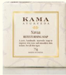
navaa soap 75 g