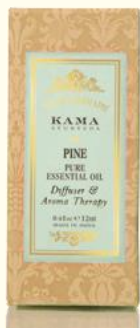
pine pure essential oil 12 ml