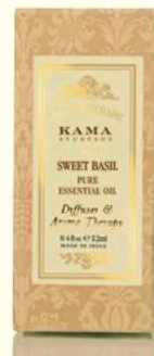
sweet basil pure essential oil 12 ml