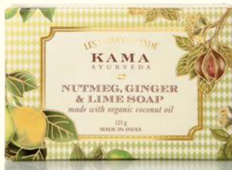
nutmeg ginger & lime soap 125 g