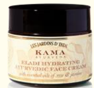
eladi hydrating face cream 50 g