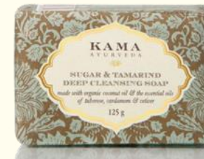
sugar & tamarind soap 125 g