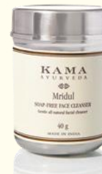
mridul soap free face cleanser 40 g