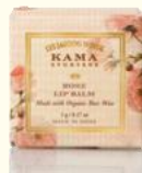
rose lip balm 5 g