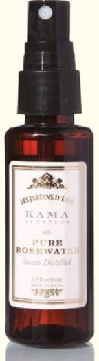
pure rose water 50 ml