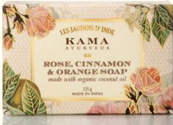
rose, cinnamon & orange soap 125 g