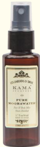
pure mogra water 50 ml