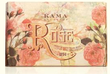
rose natural soap 125 g