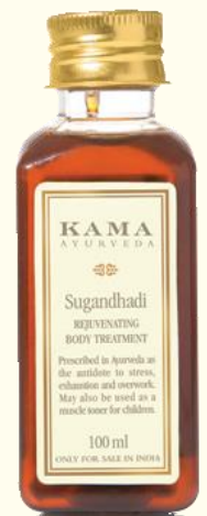
sugandhadi oil 100 ml