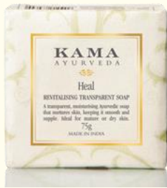
heal soap 75 g