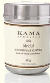
mridul soap free face cleanser 40 g