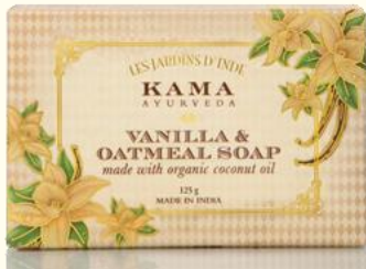
vanilla & oatmeal soap 125 g