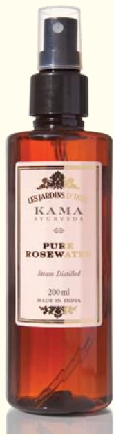
pure rose water 200 ml

Sensory refreshment inspired by age-old efficiency, with Mridul Soap Free Cleanser. The non-intrusive, relaxing caress of ancient, enigmatic Rose, with Kama's Pure Face & Body Moisturizer. Effortless radiance & tranquillity with Lavanya Natural Plant Mask.