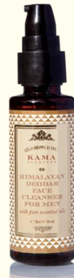
himalayan deodar face cleanser 50 ml