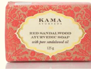
red sandalwood soap 125 g

A collection of handmade Ayurvedic Soaps, following remedial prescriptions from ancient Vedic manuscripts. Reinvigorating exfoliation with Sugar & Tamarind Deep Cleansing Soap. Gentle cleansing & calmness with Red Sandalwood Ayurvedic Soap. Emotional earthing & flawless luminosity with Turmeric & Myrrh Brightening Soap.