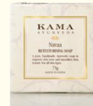
navaa soap 75 g