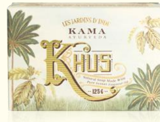
khus natural soap 125 g

Reminiscent of balmy Indian summer evenings & wafts of clean perfume on freshly bathed skin. Rose, Tulsi (Holy Basil) & Khus (Vetiver) to collect & strengthen scattered find-Body Energy. Simple secrets, for daily anti-ageing protection, and healing hydration.