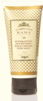
hydrating ayurvedic face cream for men 50 g