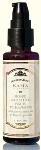
rose jasmine facecleanser 50 ml