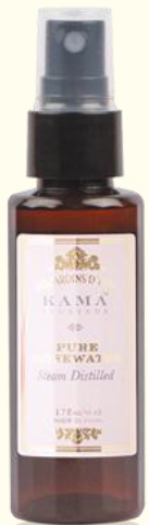
pure rose water 50 ml