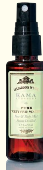
pure vetiver water 50 ml

A steadfast favourite duo. Himalayan Deodar Face Cleanser & Pure Vetiver Water, for fuss-free purifying, toning & age-delaying efficiency. Effortless deep-skin cleansing, repair & hydration for unblemished, brightened & even-toned skin.