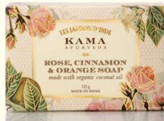
rose, cinnamon & orange soap 125 g