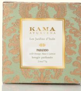
paradiso candle 75 g