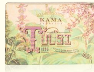
tulsi natural soap 125 g