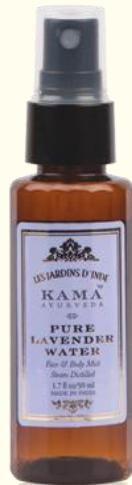
pure lavender water 50 ml